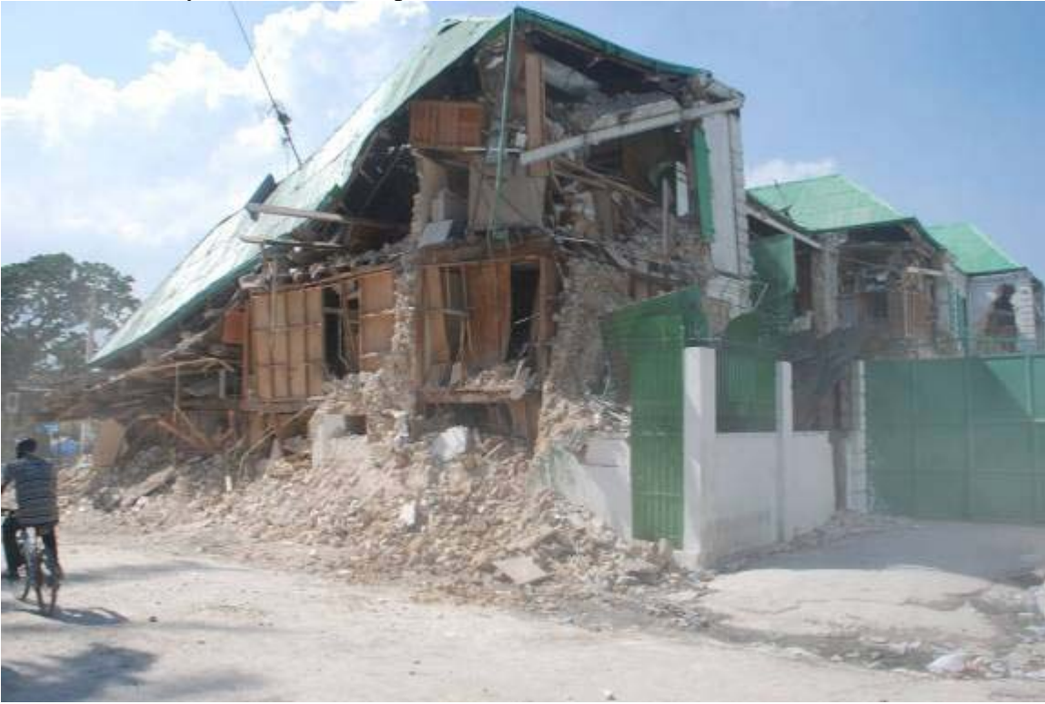
The Ministry for Health & Population's exterior walls has collapsed.