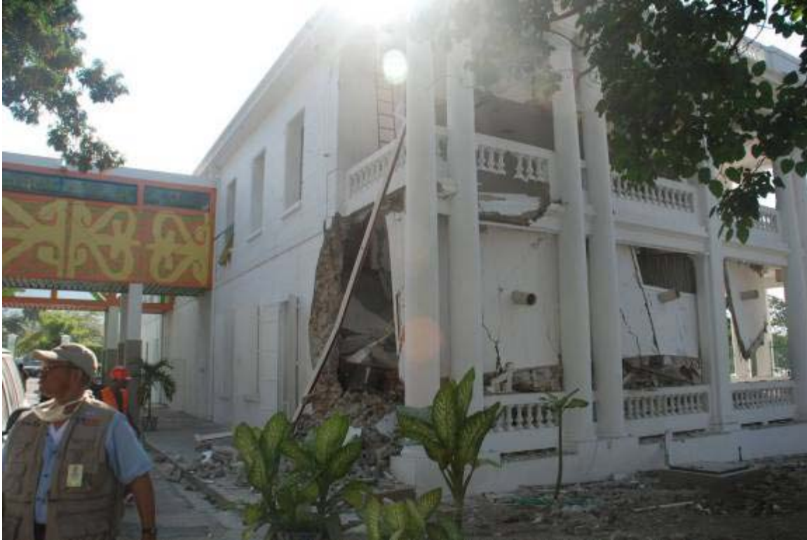
The Ministry for Culture and Communications evidenced major cracks and partial collapse of front wall and floors.