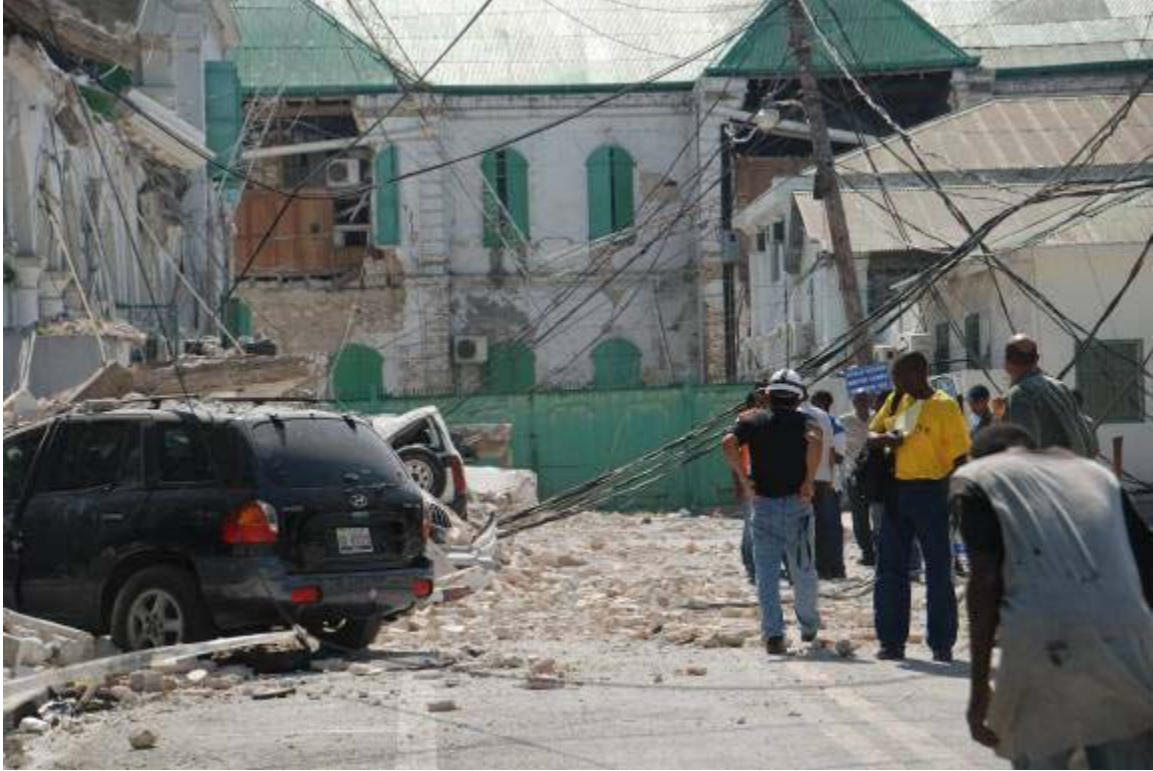
The Ministry of Planning (from rear of building)

Partial collapse of rear of building and interior floors and ceilings, and damage to the roof. Unsafe to enter.