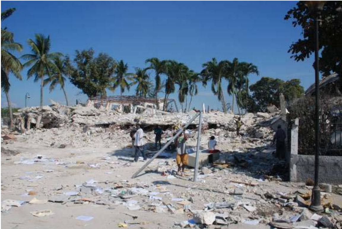
The Ministry for Foreign Affairs has completely collapsed, crews began demolition