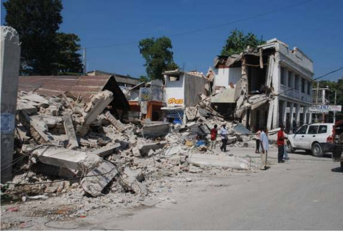
Bureau of Tax has collapsed