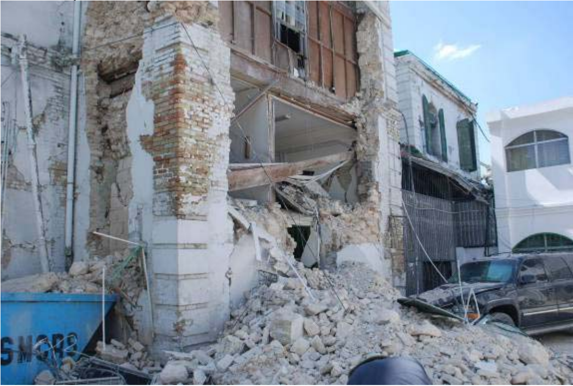
Ministry of Interior suffered major structural damage with exterior walls collapsing.