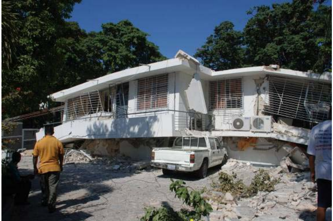
The Ministry for Haitians Abroad: severe structural damage, the building has collapsed in several sections. Unsafe to enter.