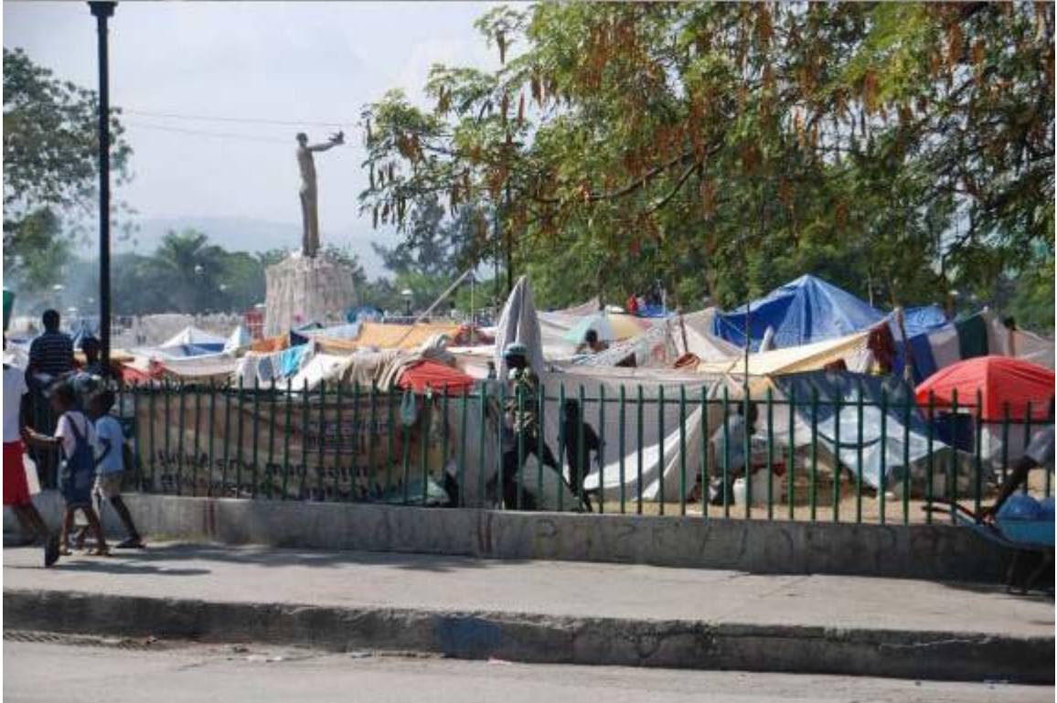
A large IDP camp sits directly across the street from the Presidential Palace.