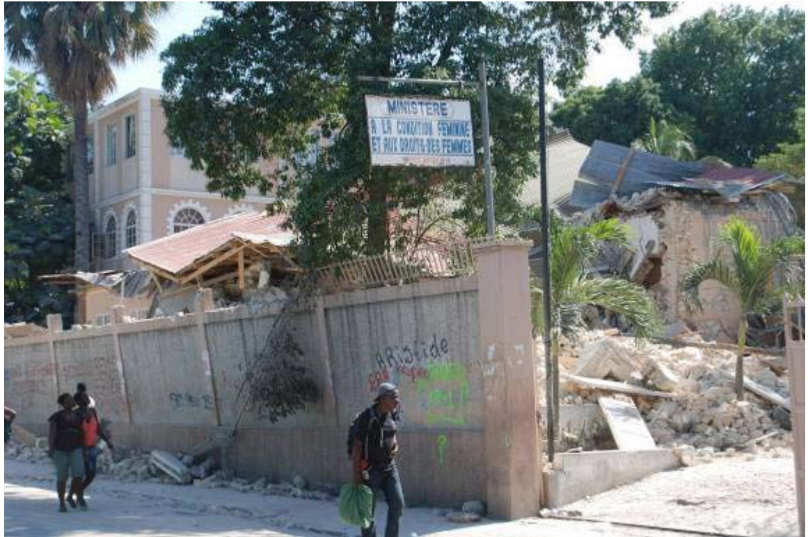
The Ministry for Women's Affairs has totally collapsed.