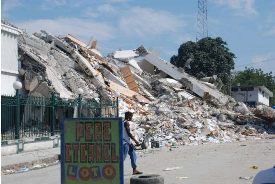
Palace of Justice has collapsed